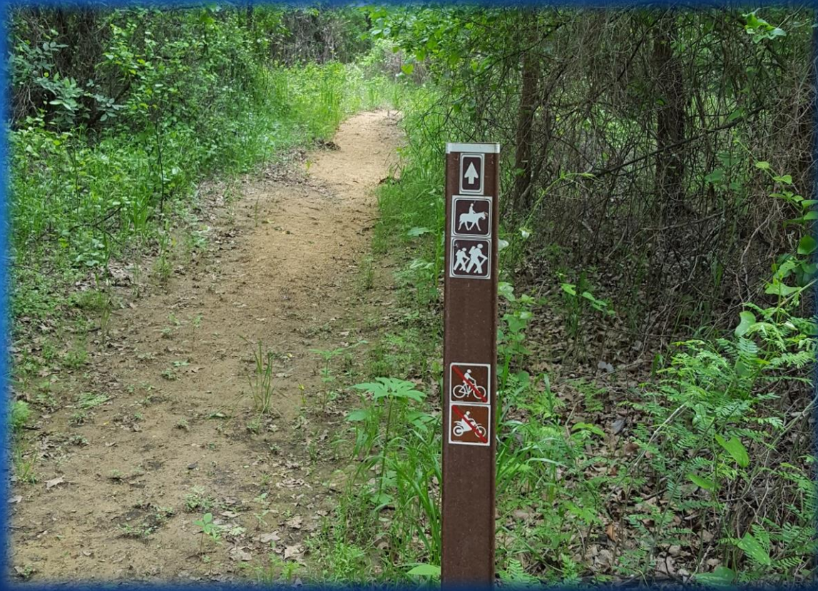
Hiking trail to Grapevine Lake